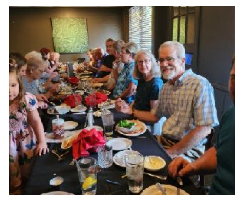
Choir and Memorial Chimes members began the season with dinner at Beefeaters on August 28, with 28 diners in attendance.